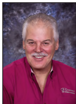
Bud Browne A-1 Heating & AC