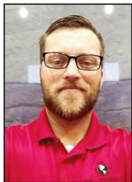
Troy Cooper Wall to Wall Stone Corp.