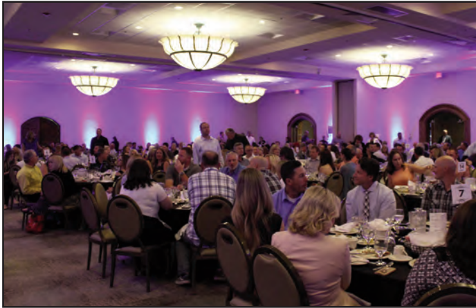
Full Banquet room!

Thank you to everyone who helped make this event and show a success! For more photos and list of winners visit our Facebook page - Parade of Homes by BCA of Southwestern Idaho.