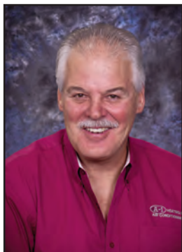
Bud Browne A-1 Heating & AC